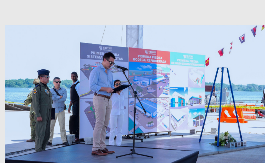
President of Ecuador Mr. Daniel Noboa

YILPORT LATAM is pleased to announce the inauguration of Container Berth #6 and the new container yard at Puerto Bolívar, Ecuador. This significant advancement marks a milestone in the modernization of the port terminal in the province of El Oro, in southern Ecuador. The total investment of over USD 400 million is the first step in an ambitious phase of strategic development, designed to improve the operational capacity of a terminal dating back to 1941.