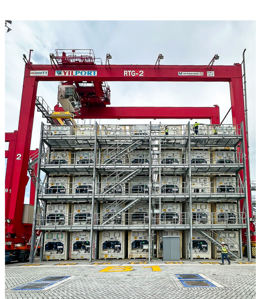
Reefer Plugs at YILPORT Puerto Bolívar

YILPORT Puerto Bolívar stands out as the most modern and efficient multipurpose port terminal in Ecuador, thanks to its strategic location and advanced deep-water infrastructure. It is part of YILPORT Holding, one of the leading port and terminal operators globally. YILPORT Puerto Bolívar continues to make a difference in the Ecuadorian port sector, offering top-notch logistics solutions and cutting-edge infrastructure to meet the demands of global trade.